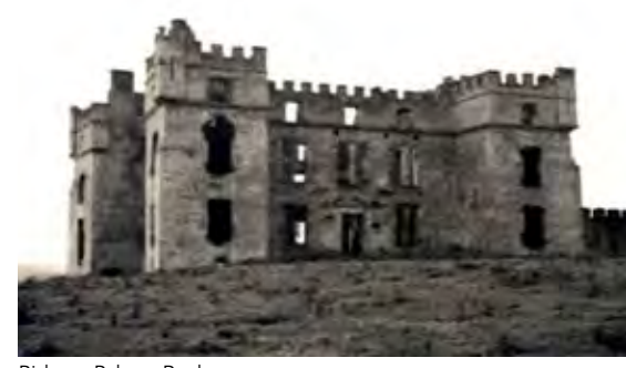
Bishops Palace, Raphoe

Some of the arriving Scots had neither English nor Gaelic and spoke Scots. Scots was used in lowland Scotland at the time. The Scots influence was to produce Ulster-Scots, which can still be found in parts of Down, Antrim, Derry/Londonderry and east Donegal. Scottish