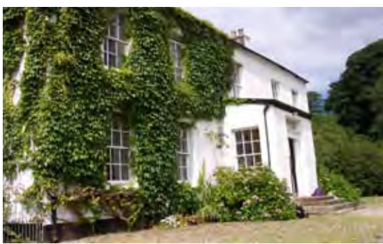
Cavanacor House, Ballindrait, County Donegal. Early 17th century plantation house.

However, more English and Scottish came to Ulster outside the years of official plantation (1610-1625) than were 'planted', especially in the later part of the century. Famine in Scotland in the 1690s saw large numbers immigrating to Ulster. More land became