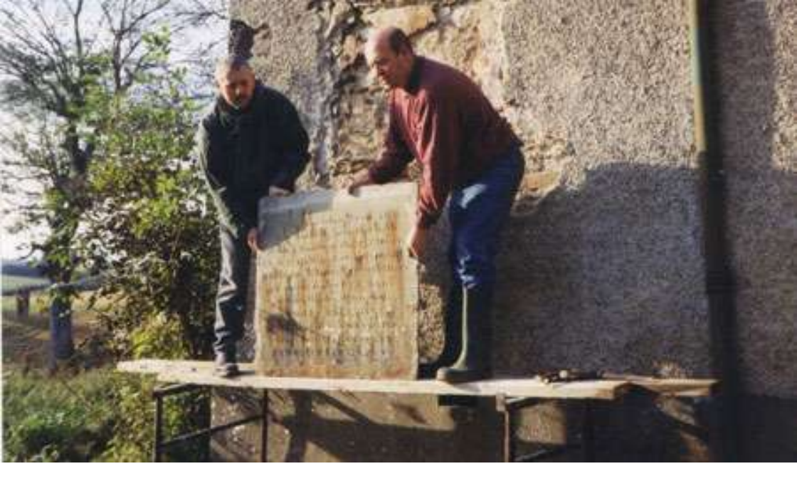
Removal of Foundation Stone from Inch