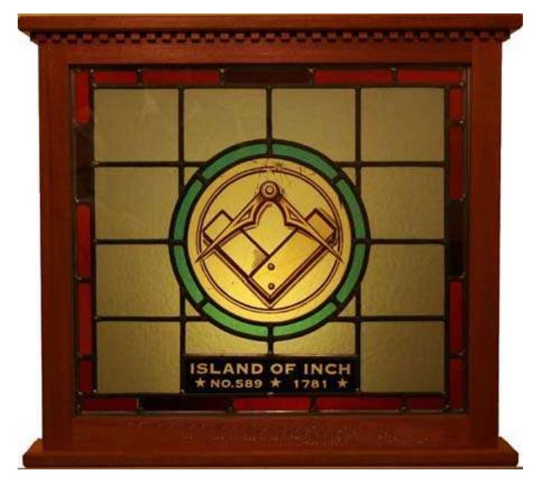
Original window from Inch Island Masonic Hall