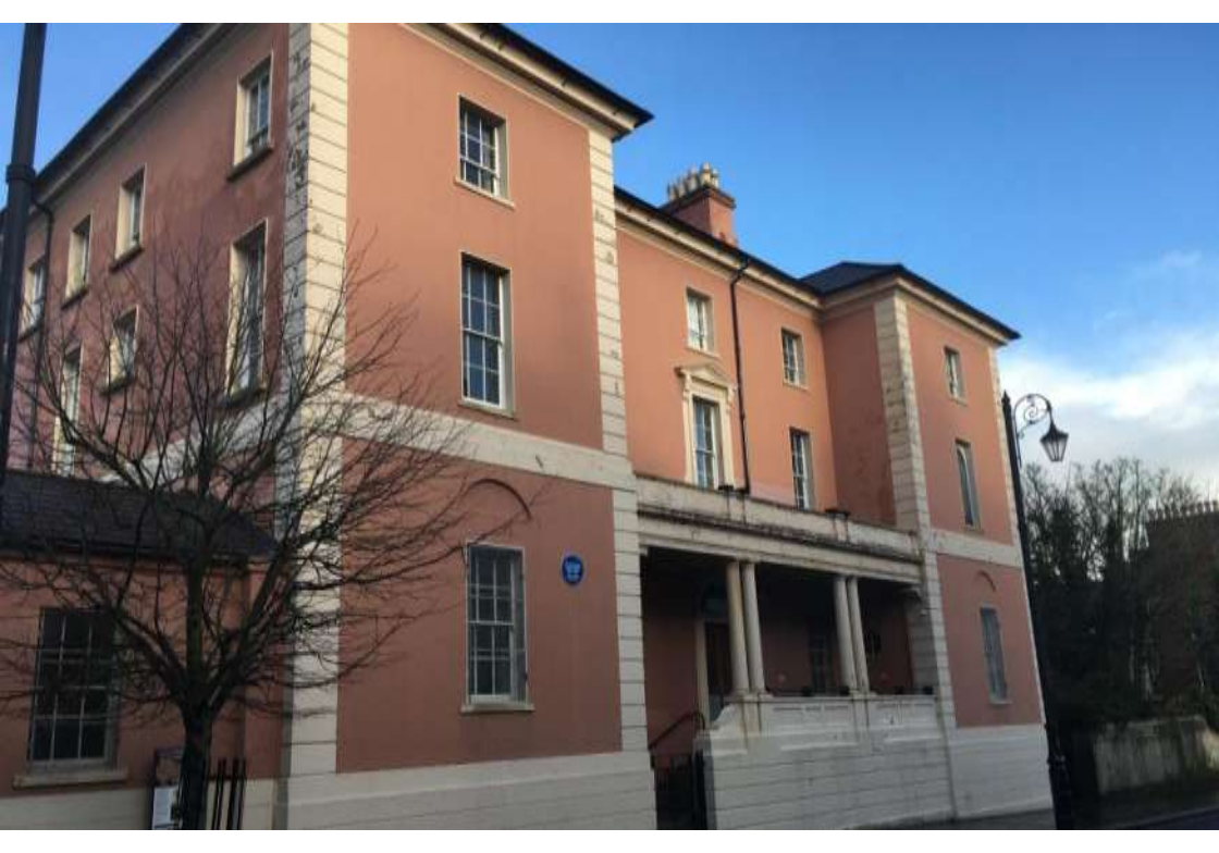
Bishop Street Freemasons Hall 2020