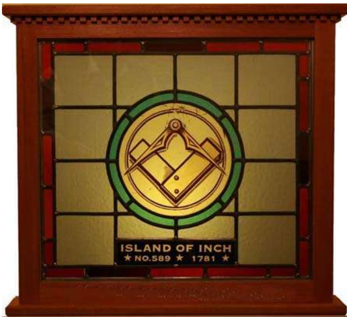
Original window from Inch Island Masonic Hall