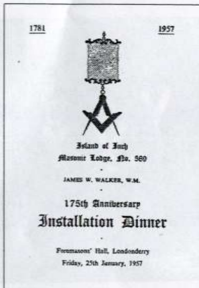
Front Cover of Menu used for 175th Installation Dinner on Friday, 25th January 1957