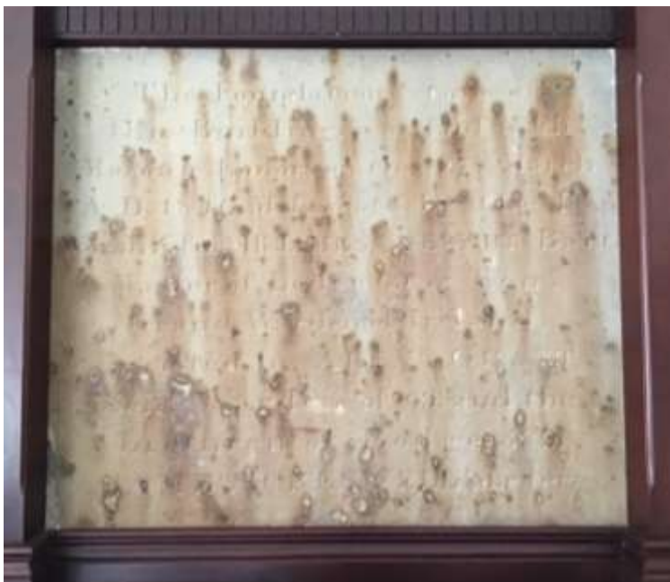
Foundation Stone from Inch Island Masonic Hall