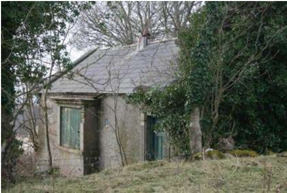
Inch Hall today