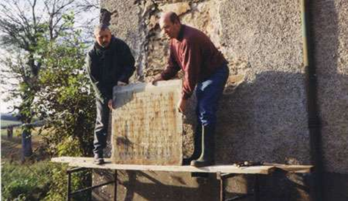
Removal of Foundation Stone from Inch