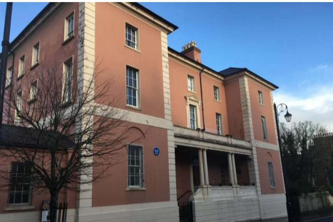
Bishop Street Freemasons Hall 2020