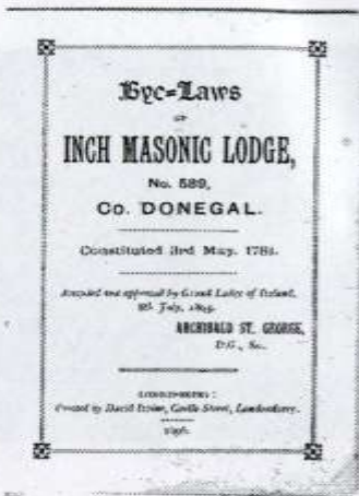
Frontispiece of the oldest extant set of Lodge Bye-Laws printed in 1896